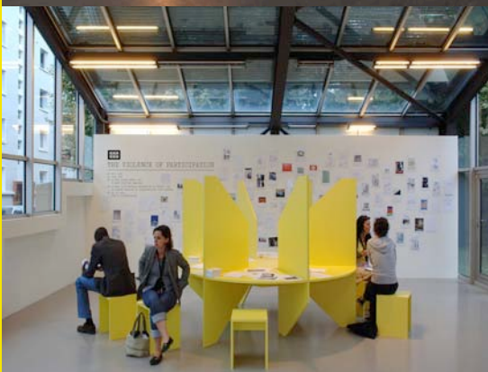
Above: Markus Miessen "The Violence of Participation"