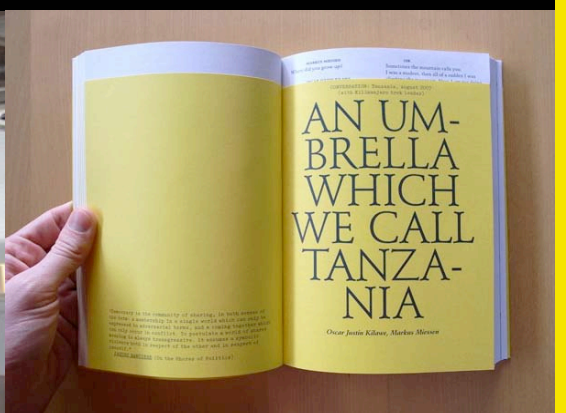
Above: Markus Miessen "The Violence of Participation - Zak Kyes"